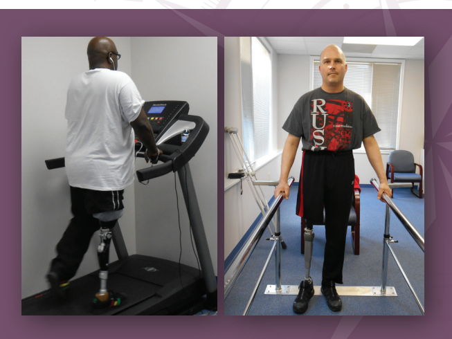
To be considered for Destination Prosthetics, you must live more than 100 miles from Leesburg, Va.

With a call to (703) 723-2803 or email to mehattingh@nwlink.com, you can find out if you qualify for this unique program and assistance with travel expenses.